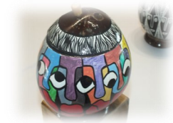
Container storage made from coconut shell

A newly developed program aiming to improve Vanuatu's handicraft sector by developing Vanuatu's economy and maximizing opportunities to grow the trade of local products thus creating employment for locals and injecting the substantial money into the local economy. According to a handicraft data produced in 2016, the value of the tourist souvenir and handicraft market is 1.3 billion vatu . However 90% of the products traded are imported thus a very large percentage of this revenue is currently supporting overseas production and businesses. This program is funded by the NZAid under the VSTAP and Australian Aid Vanuatu Skills Partnership (formerly known TVET) in collaboration with the Department of Industry.