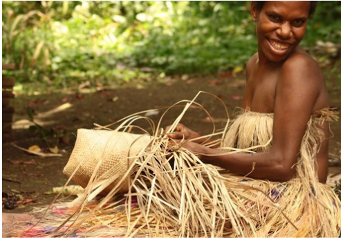
Young Vanuatu woman weaving local basket