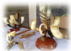
Bull's horn carefully polished for home deco